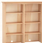
1632AUF • Hutch 50-11/16"W x 51-1/8"H